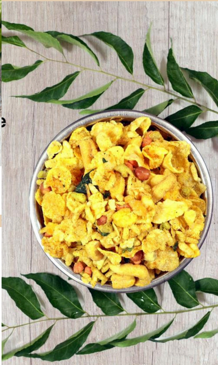
Khatta Mitha Mixture (UG-8)