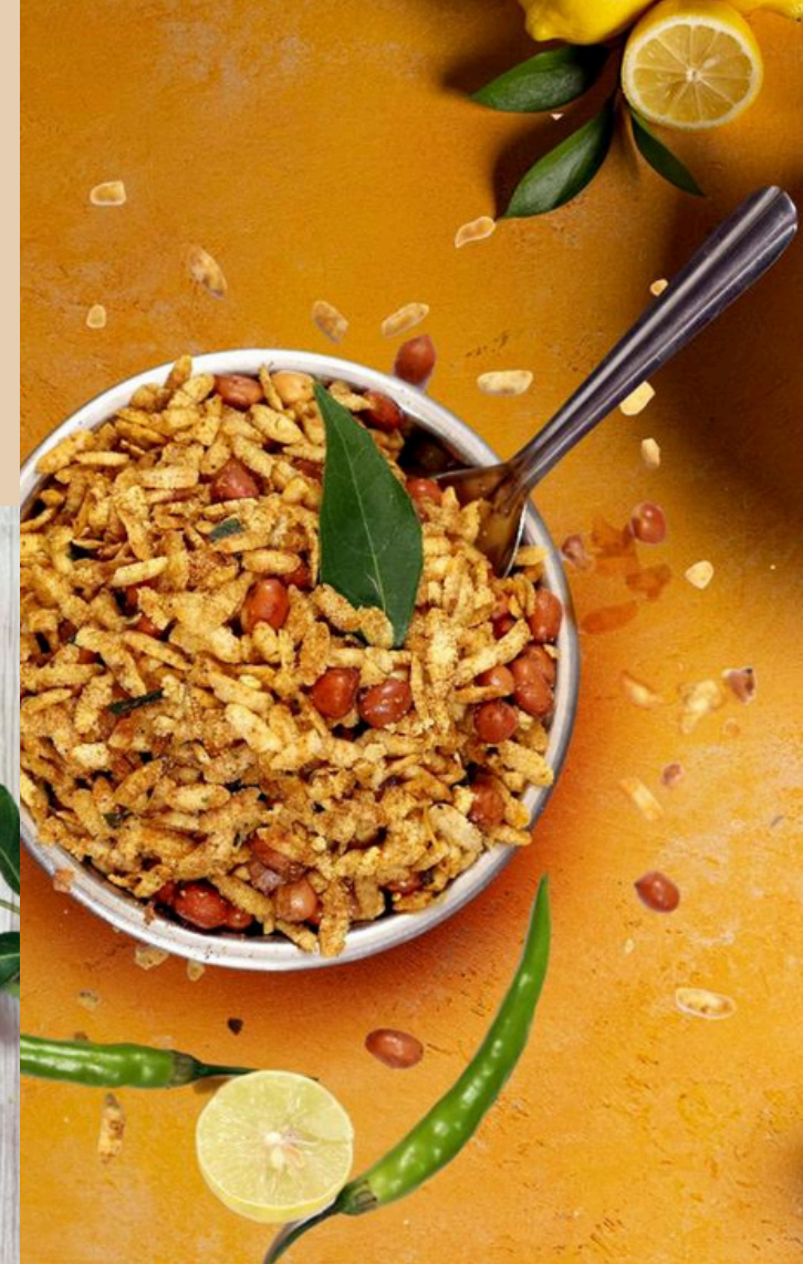
Poha Chivda (UG-9)